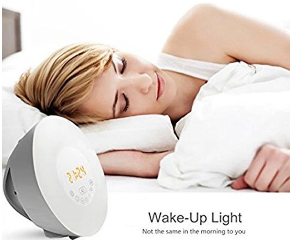
Wake-Up Light Not the same in the morning to you