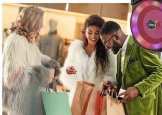
Shopping for dinner