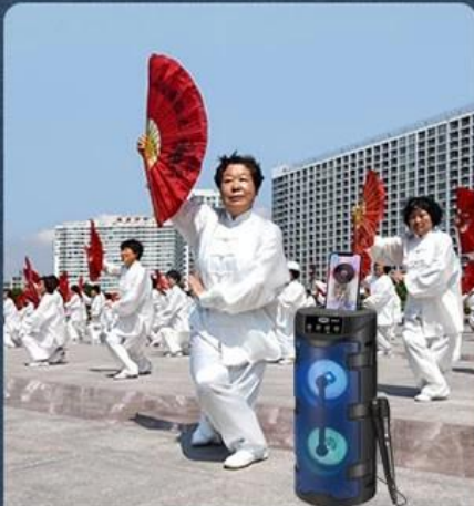
3. Square dancing