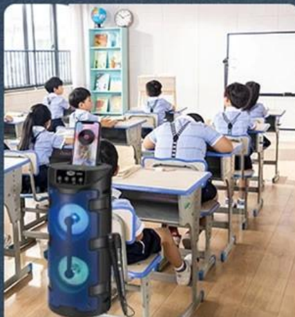
4. The lecturer