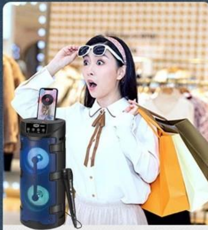
2. Store sales promotion