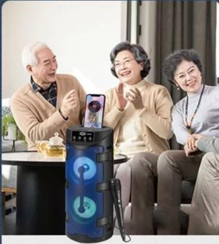
1. Family reunion