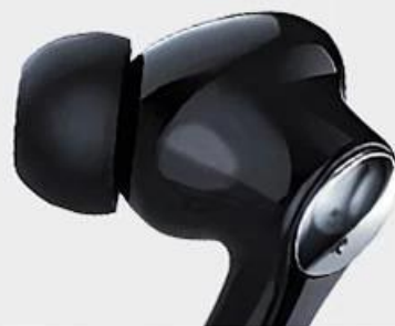
Soft eartips do not cause pain in the ear canal when worn for a long time