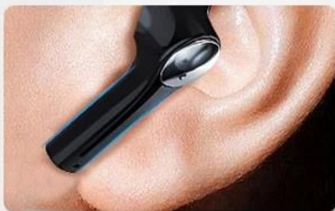
Ergonomic design that fits snugly to the ear

Both earphones can individually increase or decrease volume More convenient and clear