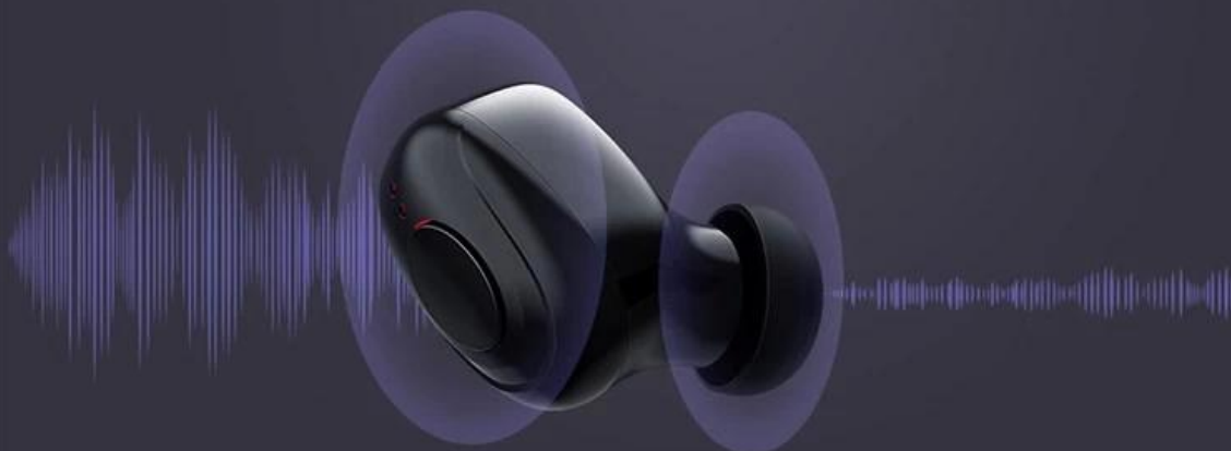
▲ Before noise reduction