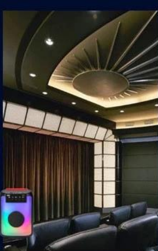
The meeting room