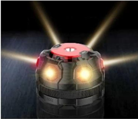
6 Amber color SMD LED flash for car emergency