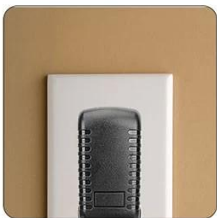
Connect to Power

Put the wireless charger on the edge of the desktop