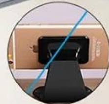
Grips / Stands