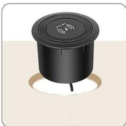
Put the wireless charger into the hole

Put the wireless charger on the edge of the desktop