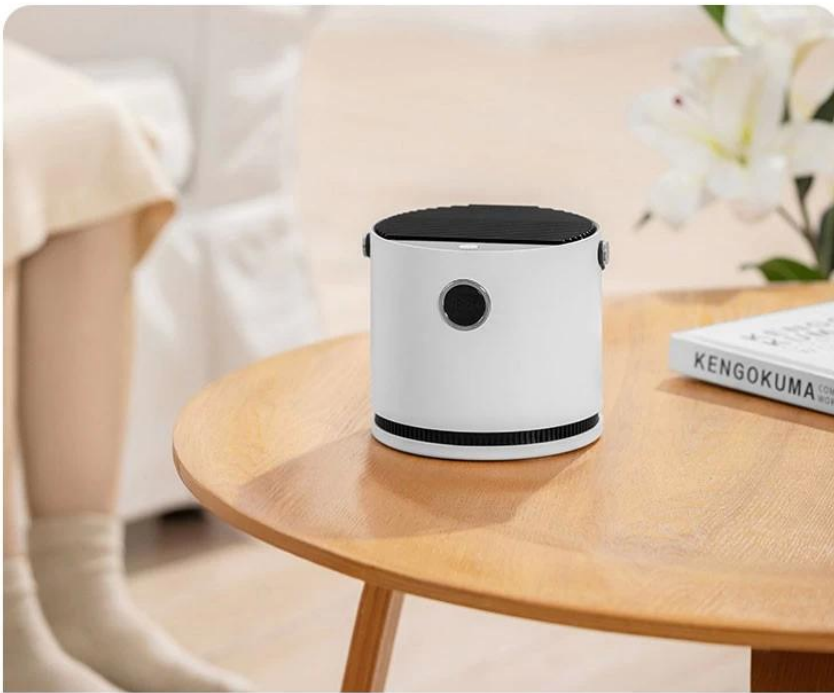
The sitting room