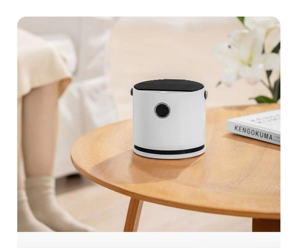
The sitting room