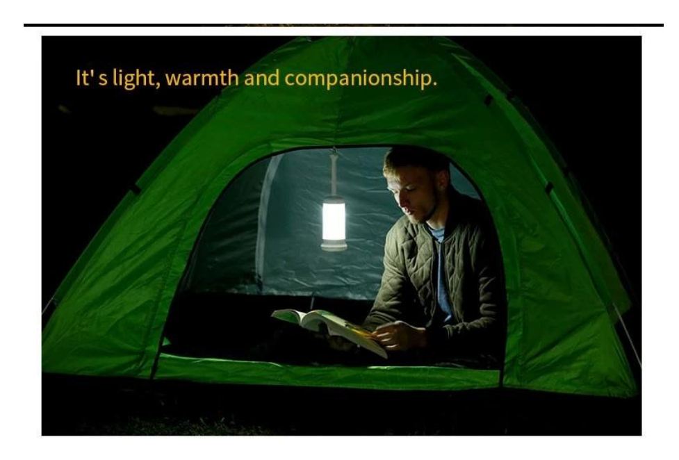
3. Ambient light

Used as ambient light when friends attend a wild party.