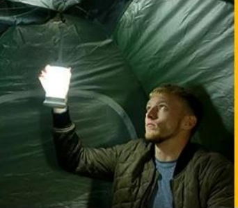
LIGHT UP SPIRIT LIGHTS FOR US.