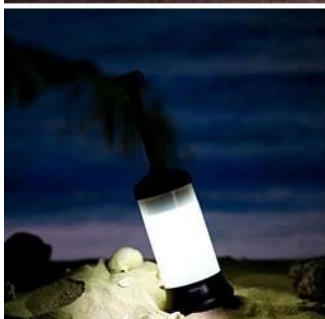
POWER CUT IN THE OUTDOOR