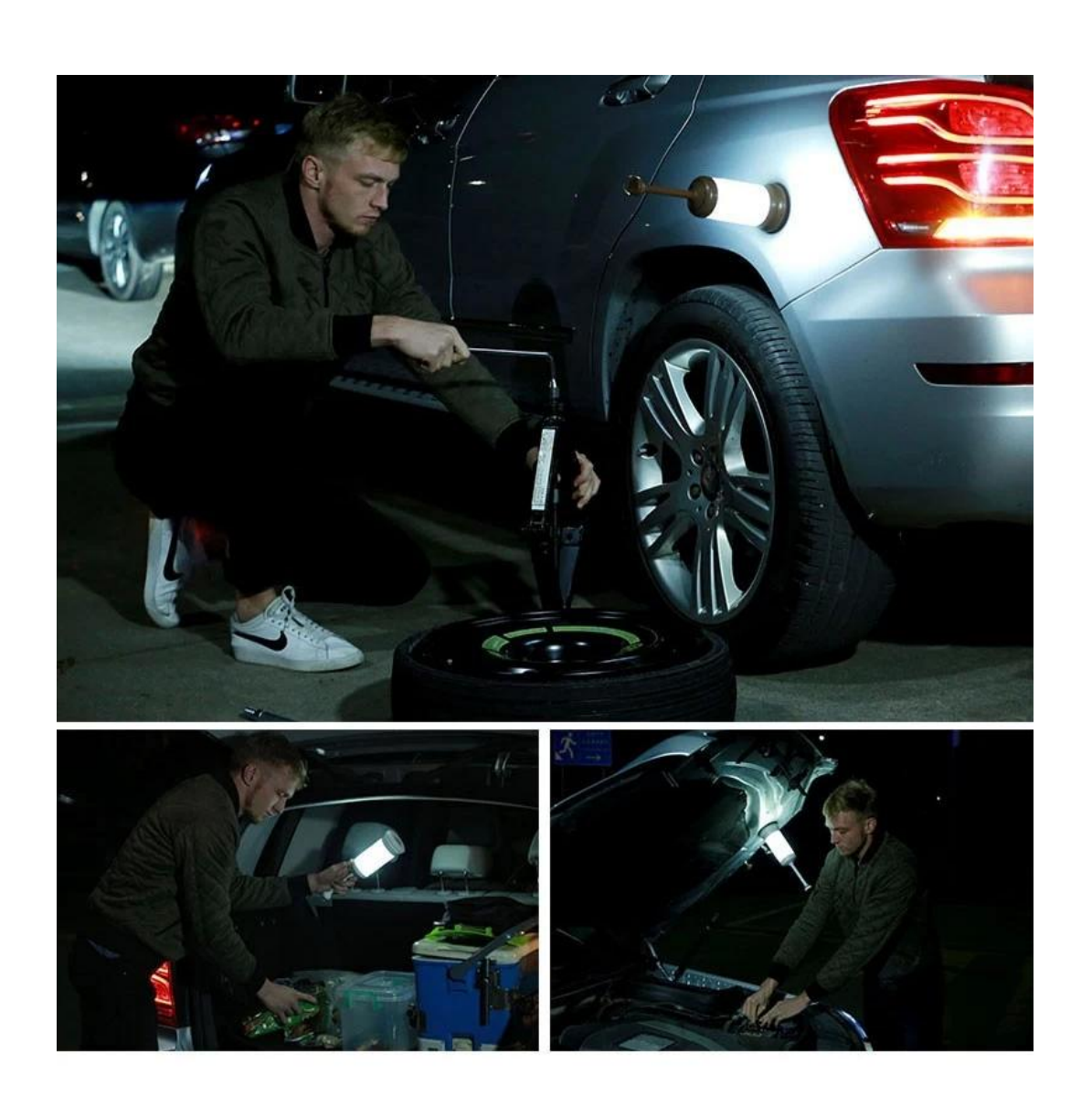
\label{eq:2.0} \textbf{2. Night light} \\ \text{Used as a night light when traveling by car, outdoor camping, fishing in the night.}