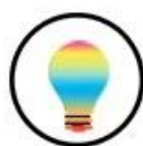
Multi - Lamp