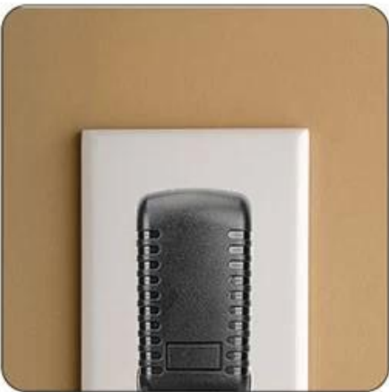
Connect to Power

Put the wireless charger on the edge of the desktop