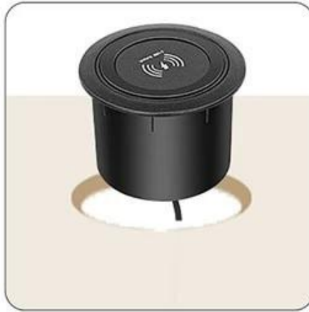
Put the wireless charger into the hole