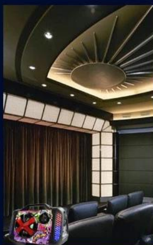
The meeting room