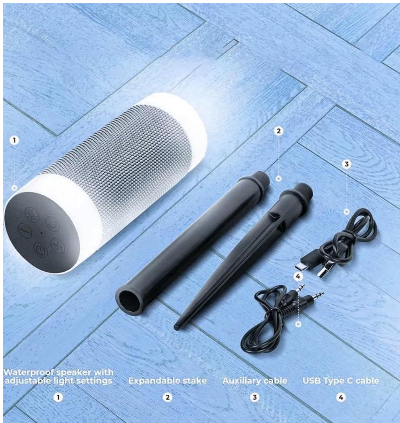
Waterproof speaker with adjustable light settings