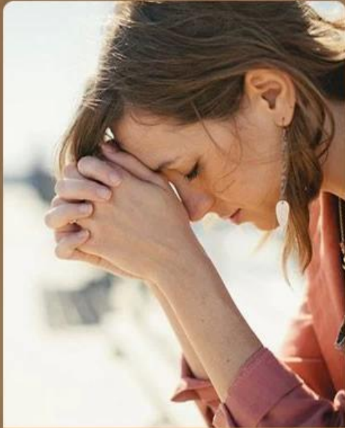
Take a rest